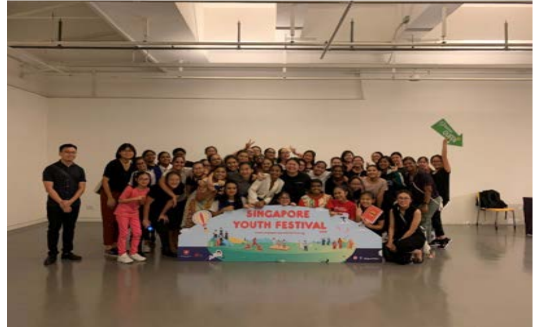
CentreStage - Drama