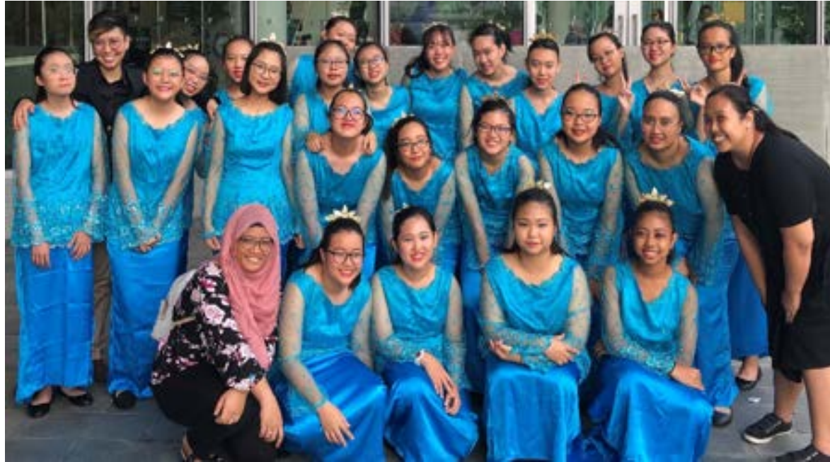
Angklung & Kulintang Ensemble