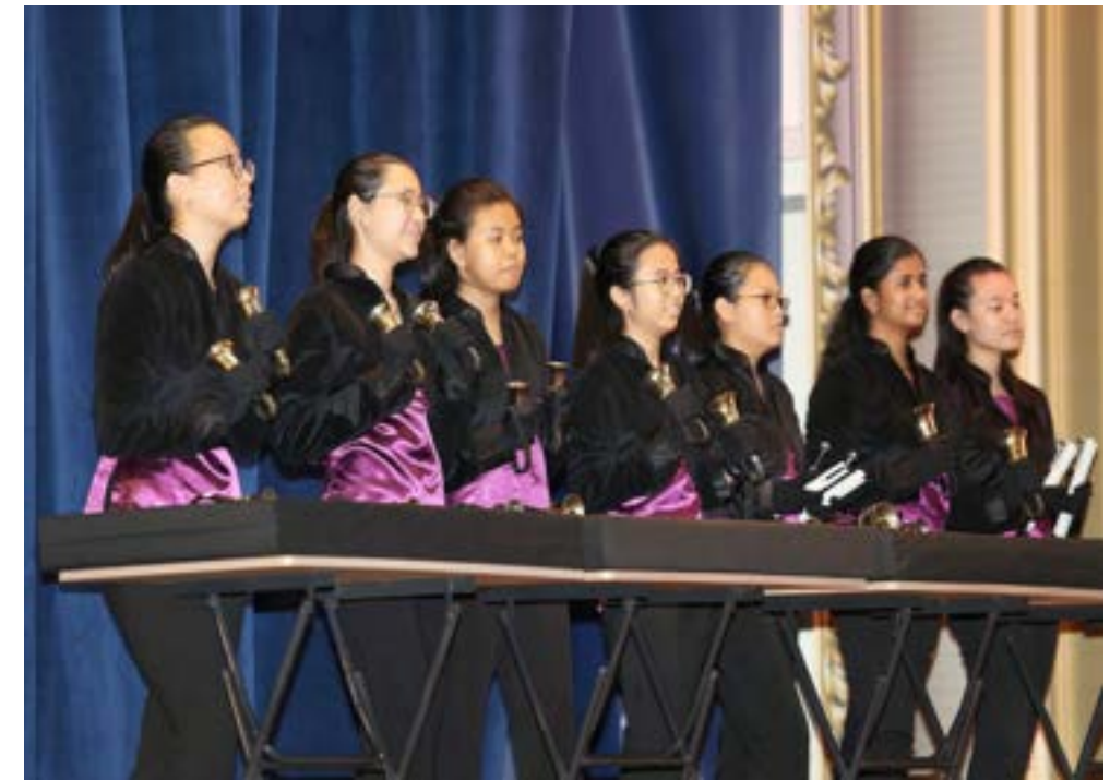
Handbell & Handchime Ensemble