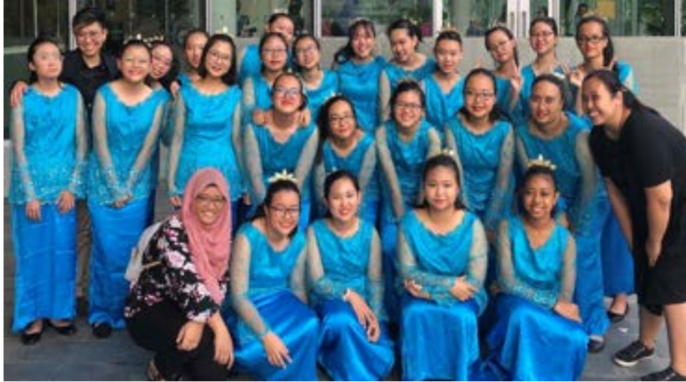
Angklung & Kulintang Ensemble