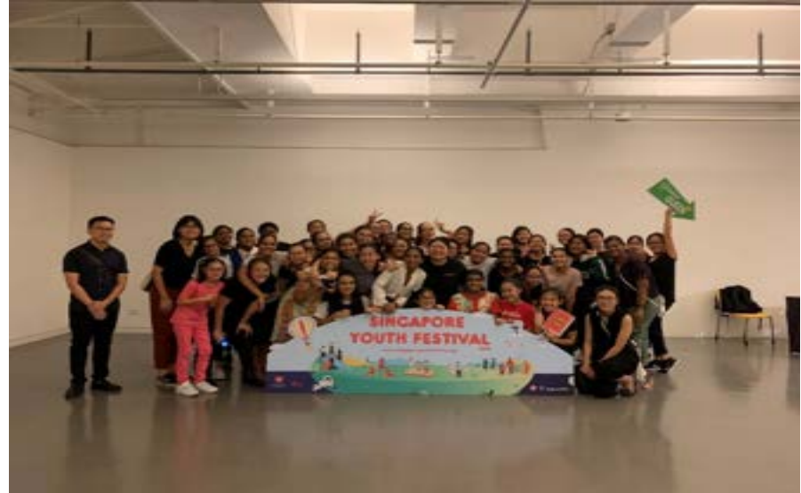
CentreStage - Drama