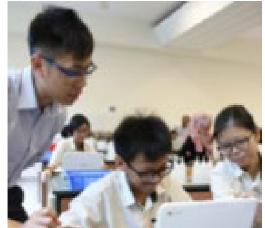
Enhance Teaching and Learning