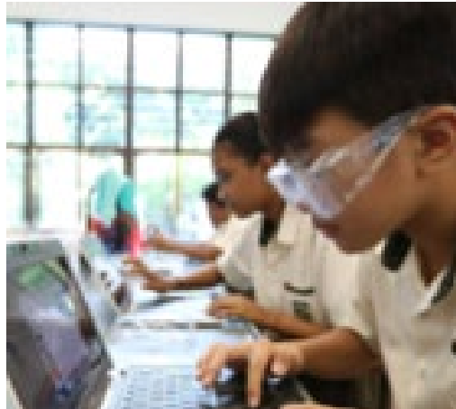
Support Self-Directed and Collaborative Learning