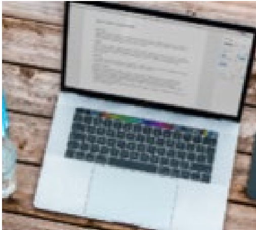
Support the Development of Digital Literacy

The use of the PLD for teaching and learning aims to: